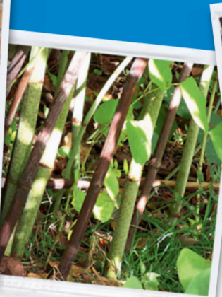
Invasive Weed Control